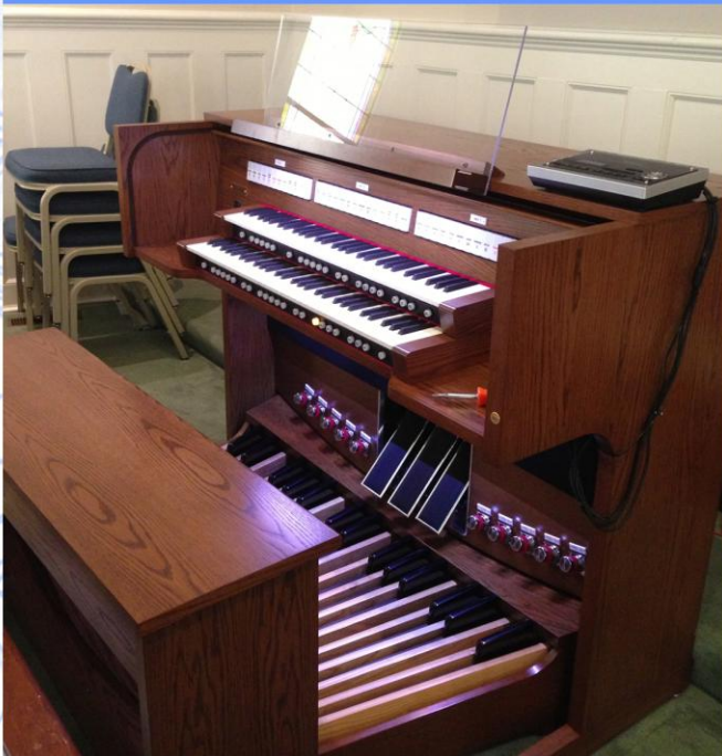
Sardinia Presbyterian Church Sardinia, South Carolina