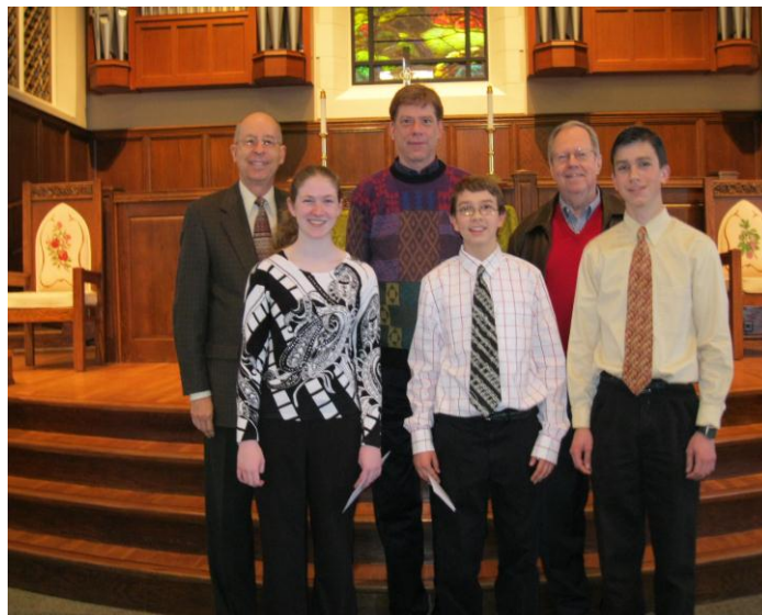
2012 Young Organist Competition Winners