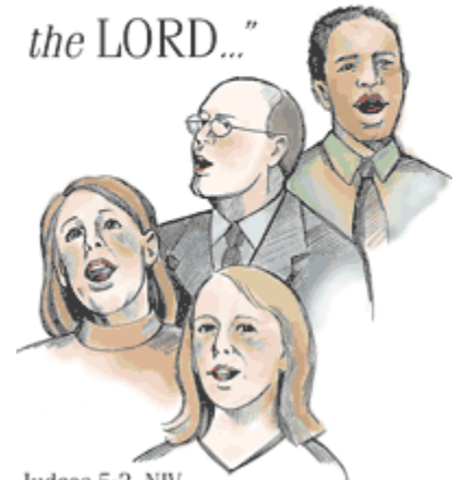
Judges 5:3, NIV

"I will sing to the LORD, I will sing; I will make music to the LORD..."