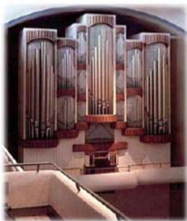
Holtkamp Organ University of Alabama

www.music.ua.edu/departments/organ/2009/preregistration