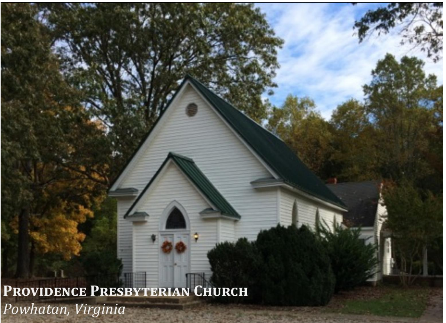
PROVIDENCE PRESBYTERIAN CHURCH Powhatan, Virginia