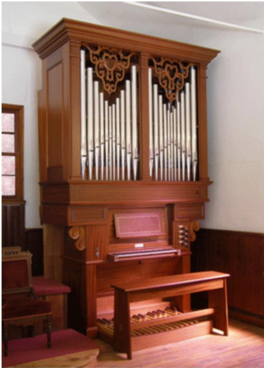
Top Left: Wesley United Methodist Church, Elkton, MD