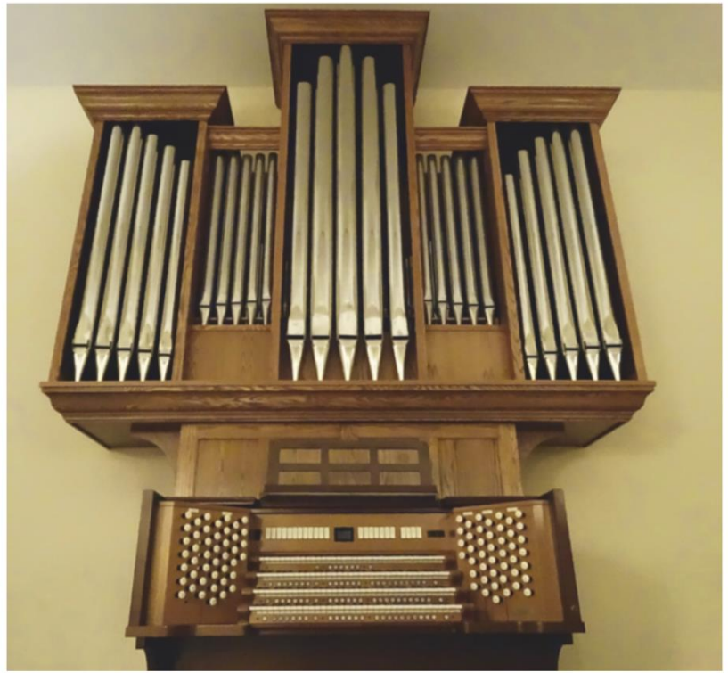
Top Right: R. A. Daffer Showroom, Jessup, MD