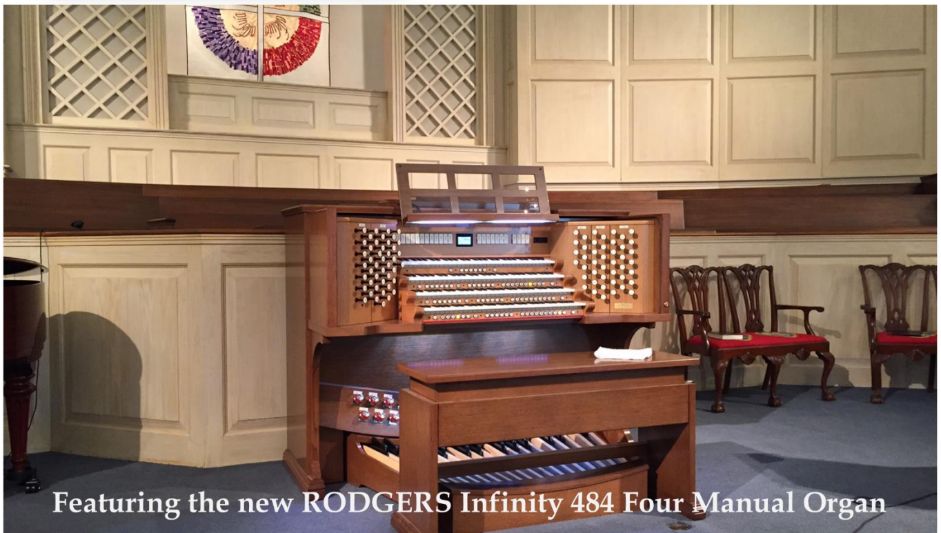
Featuring the new RODGERS Infinity 484 Four Manual Organ