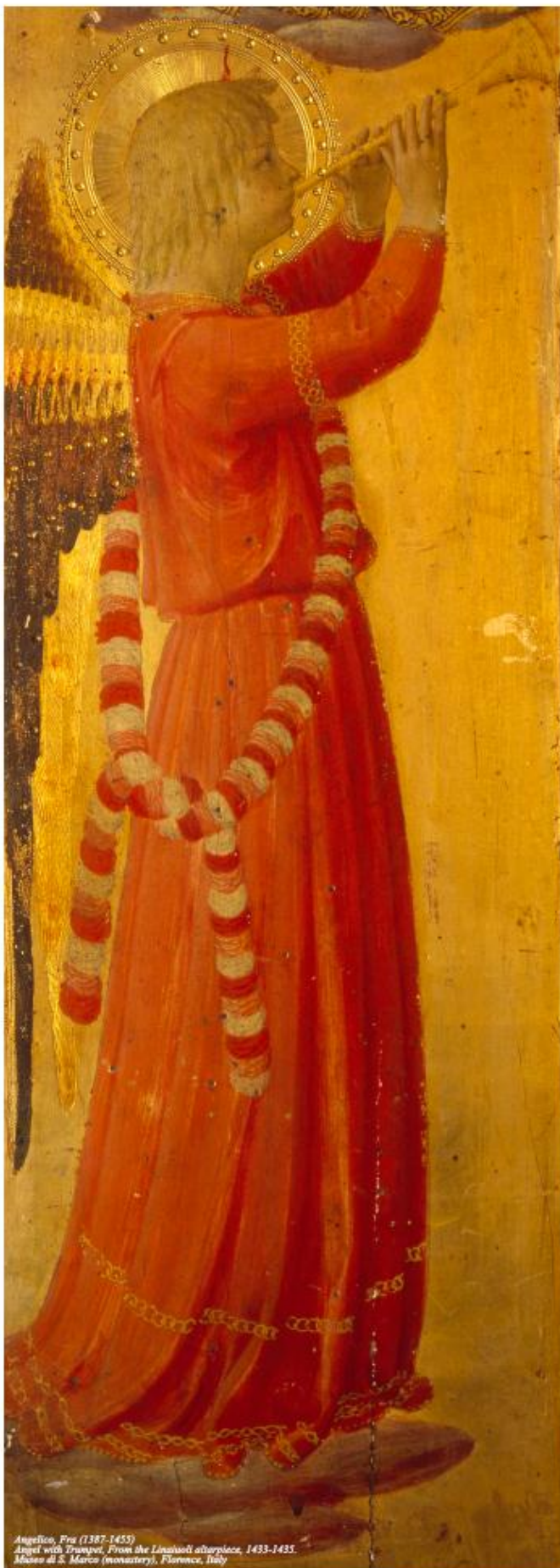
Angelico, Fra (1387-1455) Angel with trumpet, From the Linaioli altarpiece, 1433-1435. Museo di S. Marco (monastery), Florence, Italy

The University of South Carolina Concert Choir