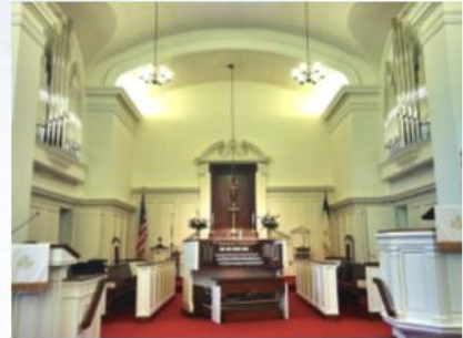
First United Church of Christ - Salisbury, NC Custom Rodgers console/11 ranks of pipes