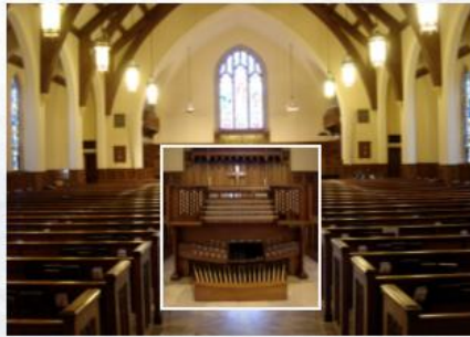
Trinity United Methodist Church - Sumter, SC Custom 4 manual Rodgers/29 ranks of pipes