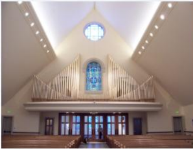
St. Louis Catholic Church - Clarksville, MD Rodgers 3 manual/11 ranks of pipes