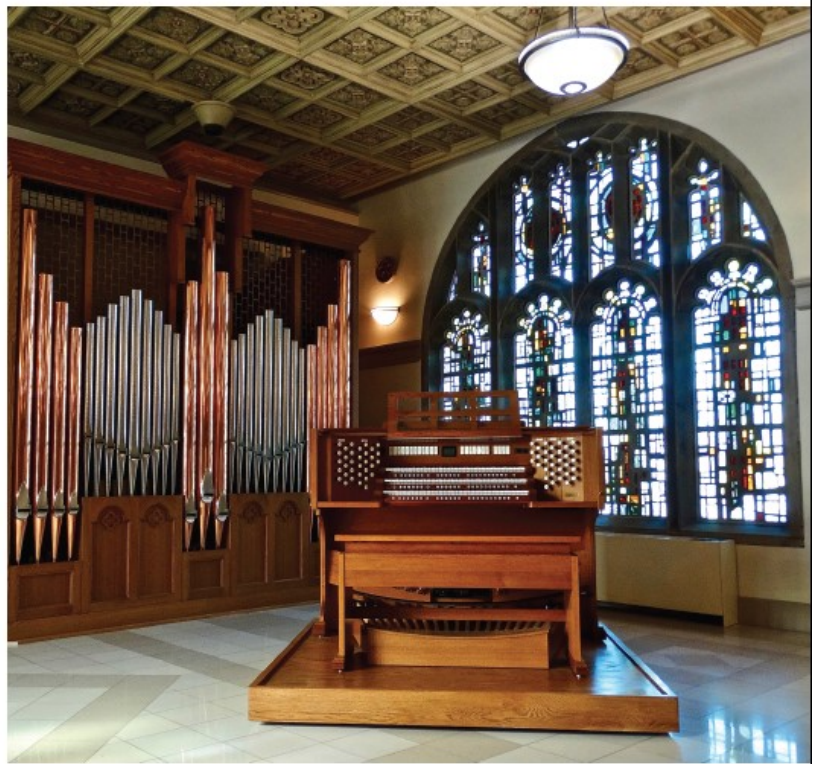
THEOLOGICAL COLLEGE, WASHINGTON, D.C.

is a full-line representative for pipe, digital, and hybrid organ solutions.