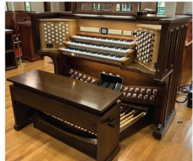
Apex United Methodist Church Apex, North Carolina Rodgers Infinity 367 custom