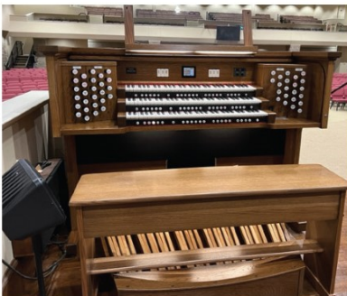
Faith Baptist Church Taylors, South Carolina Rodgers Imagine 351