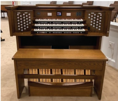
Cedar Falls Baptist Church Fayetteville, North Carolina Rodgers Imagine 351