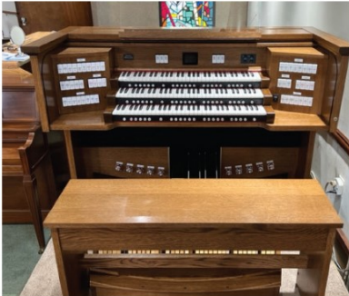
Saint James Catholic Church Conway, South Carolina Rodgers Imagine 351