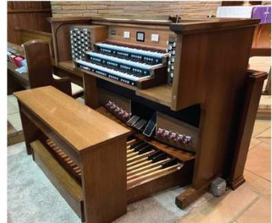
Macedonia Lutheran Church Burlington, North Carolina Rodgers Imagine 351