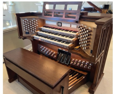
Sacred Heart Catholic Church Salisbury, North Carolina Rodgers Infinity 367 custom