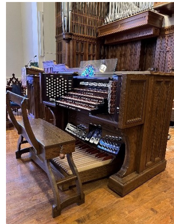
Central United Methodist Church (Don Grice) 167 South Irby St. 1988 Schantz; 4 manuals / 68 ranks; 2022 new console and revoicing by Orgues Letourneau.