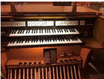
St. Luke Lutheran Church (Joyce Shaw) 1201 Cherokee Rd. 1987 Schantz; 2 manuals/ 20 ranks. Relocated to current location; expanded in 2003.

**Please email Susan Sturkie at sloopystur@aol.com by Sunday, April 16, if you plan to attend , so that travel plans and restaurant reservations can be made. Please indicate whether or not you will eat lunch at Victor's. If you'd like to carpool, please indicate if you're willing to drive or if you would like to ride with someone. If you can drive, please indicate how many passengers you can carry. We'll meet at 8:30 sharp at the Two Notch Road / I-20 Lowe's.