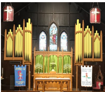
(Artist's rendering: work in progress.) St. John's Anglican Church (Jim Hepler) – 252 South Dargan St. 2023 Lincoln; 3 manuals / 37 pipe ranks, 22 digital. French Terraced Console. Built around Aeolian-Skinner Op. 1338. (Swell almost exclusively Aeolian-Skinner, with additional ranks in the Great.)