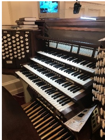
First Baptist Church (Ann Dowling) 300 South Irby St. 1951 Reuter (Schantz console) Opus 935; 4 manuals /51 ranks.