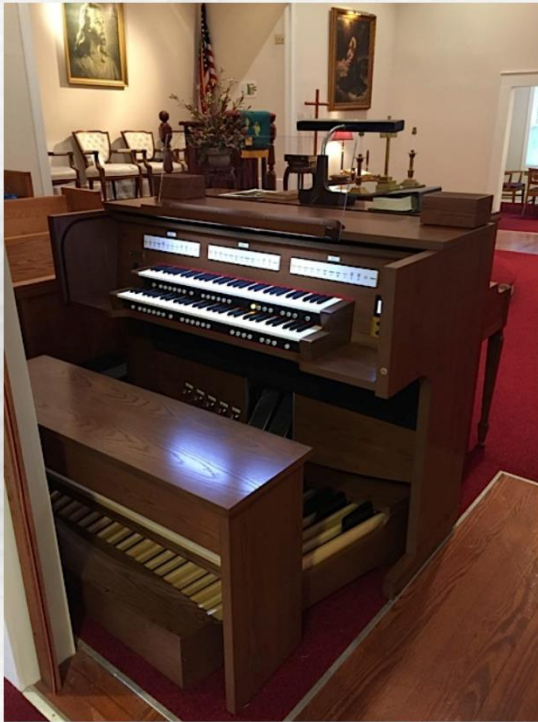
OAK GROVE UNITED METHODIST CHURCH Blythewood, South Carolina Rodgers 569