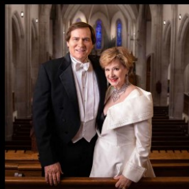
The Chenault Organ Duo