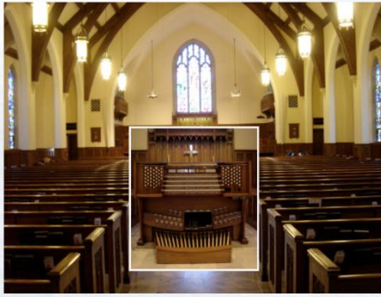
Trinity United Methodist Church - Sumter, SC Custom 4 manual Rodgers/29 ranks of pipes