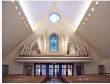
St. Louis Catholic Church - Clarksville, MD Rodgers 3 manual/11 ranks of pipes