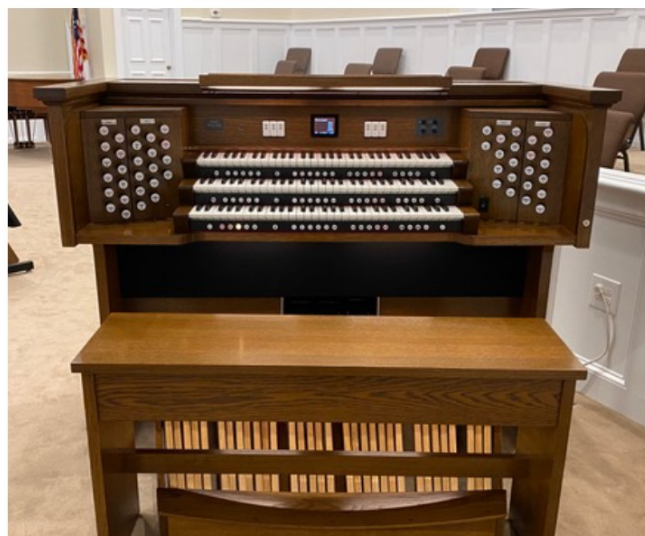
Cedar Falls Baptist Church, Fayetteville, NC Imagine 351-D