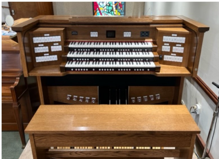
St. James Catholic Church, Conway, SC Imagine 351-T

The Imagine Series 351D captivates the audience and organist with magnificent true-to-life pipe organ samples. The organ features 59 main pipe organ stops, including Chimes and Zimbelstern. Each drawknob represents four selectable stops, resulting in a total of 198 Voice Palette™ stops spread across 4 unique organ styles: American Eclectic, English Cathedral, French Romantic and German Baroque.