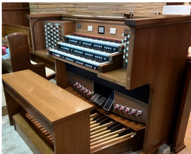
Macedonia Lutheran Church, Burlington, NC Imagine 351-M

The 351 is available with Mechanical Drawknobs, Lighted Drawknobs, and Lighted Stoptabs.