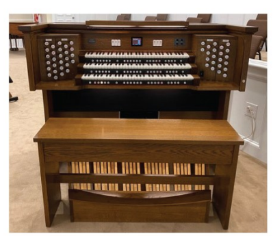
Cedar Falls Baptist Church Fayetteville, North Carolina Rodgers Imagine 351