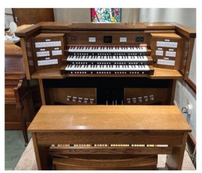
Saint James Catholic Church Conway, South Carolina Rodgers Imagine 351