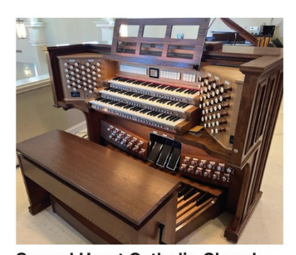
Sacred Heart Catholic Church Salisbury, North Carolina Rodgers Infinity 367 custom