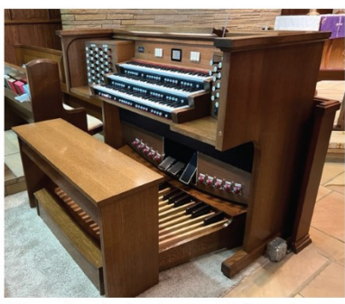
Macedonia Lutheran Church Burlington, North Carolina Rodgers Imagine 351