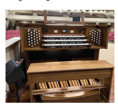
Faith Baptist Church Taylors, South Carolina Rodgers Imagine 351