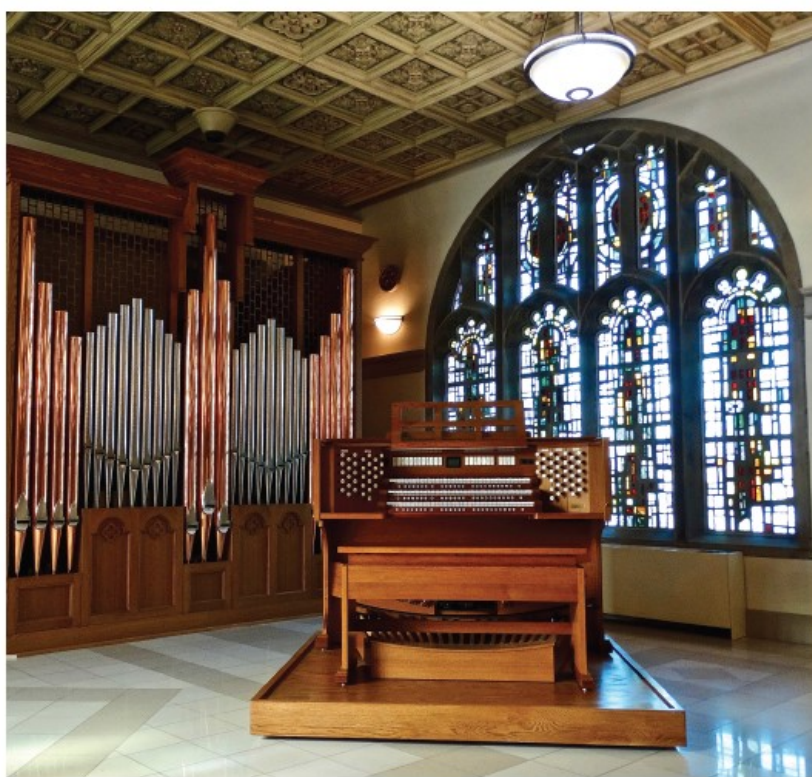
THEOLOGICAL COLLEGE, WASHINGTON, D.C.

is a full-line representative for pipe, digital, and hybrid organ solutions.