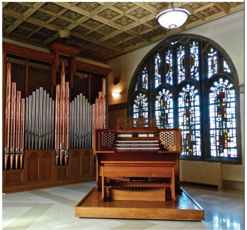
THEOLOGICAL COLLEGE, WASHINGTON, D.C.

is a full-line representative for pipe, digital, and hybrid organ solutions.