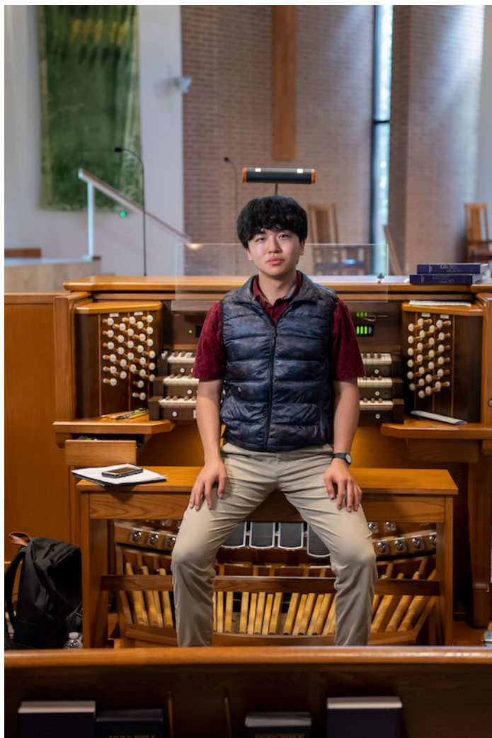
Schweitzer Organ Festival in Hartford, Connecticut.