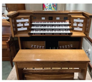
Saint James Catholic Church Conway, South Carolina