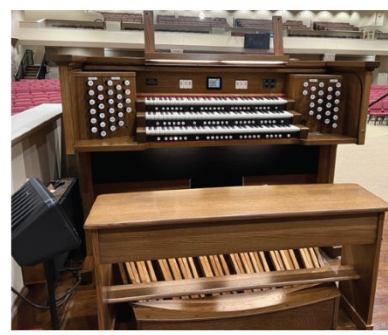
Faith Baptist Church Taylors, South Carolina Rodgers Imagine 351