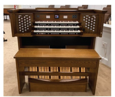
Cedar Falls Baptist Church Fayetteville, North Carolina Rodgers Imagine 351