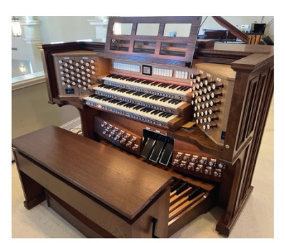
Sacred Heart Catholic Church Salisbury, North Carolina Rodgers Infinity 367 custom