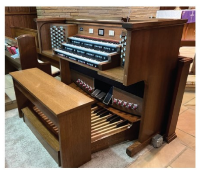
Macedonia Lutheran Church Burlington, North Carolina Rodgers Imagine 351