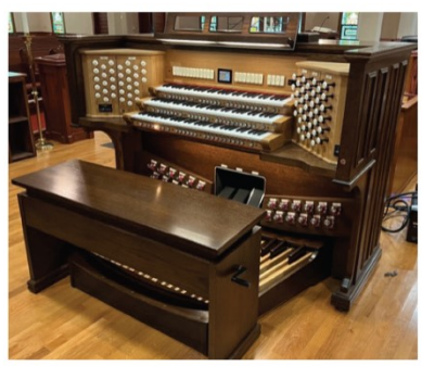
Apex, North Carolina Rodgers Infinity 367 custom