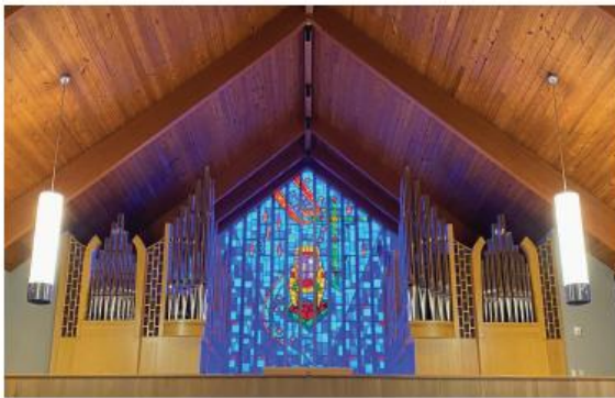
ST. KATHERINE OF SIENNA WAYNE, PA TWIN 3 MANUAL CONSOLES 39 RANKS