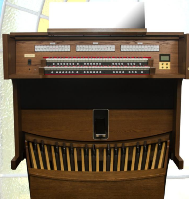
Rodgers Classic 559