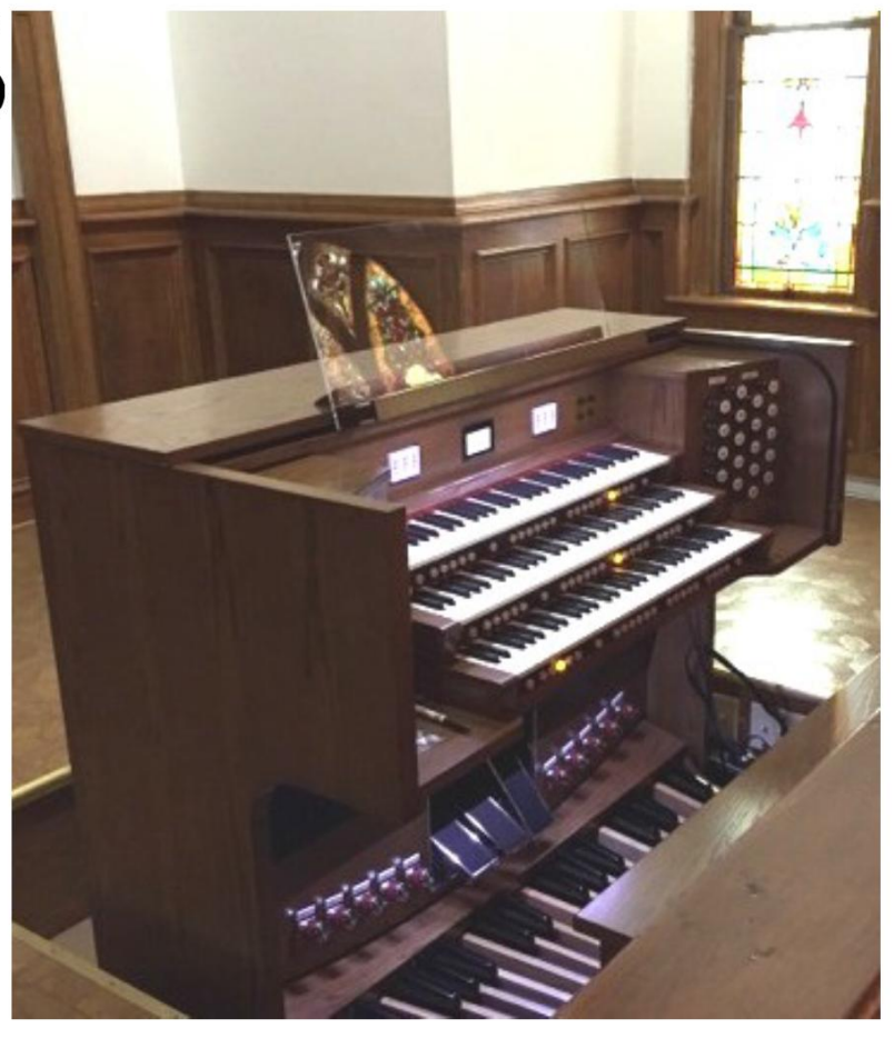
FIRST PRESBYTERIAN CHURCH Wadesboro, North Carolina